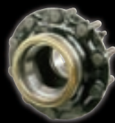
Ductile Iron Standard Hub Assemblies