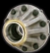
Aluminum Standard Hub Assemblies