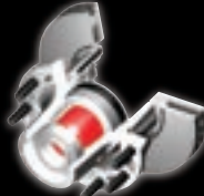
PreSet® Hub and Rotor Assemblies