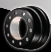
TruTurn™ Brake Drums