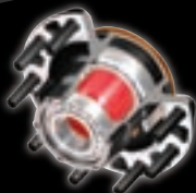
Ductile Iron PreSet® Hub Assemblies