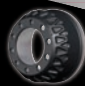
CastLite® Brake Drums