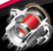
Aluminum PreSet® Hub Assemblies

ConMet brake drums are fully interchangeable with competitor drums. A complete competitive crossover list is available at www.conmet.com .